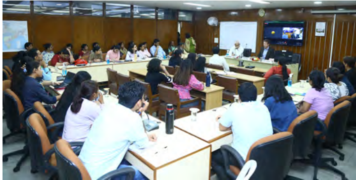
NIEPA Scholars Interaction Programme

This programme is designed to build the research capacity of scholars from varied backgrounds and provide a strong knowledge and skill base in related areas of educational policy, planning, administration and finance. The research studies completed under the PhD programme are expected to make significant contributions in enriching the knowledge base, besides providing critical inputs for policy formulation, implementation of reform programmes and capacity building activities. The broad areas of research covering school and/or higher education are as under: