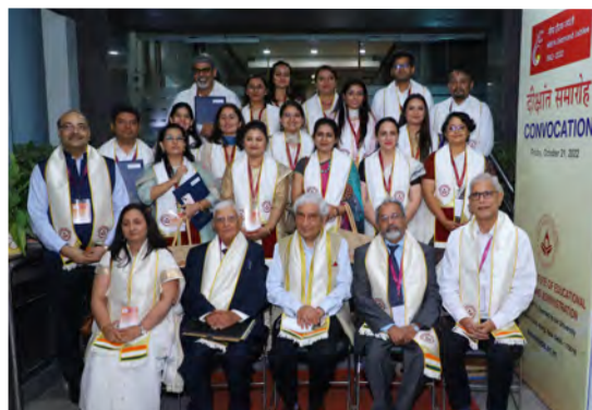
Convocation October 21, 2022

The scholars registered for the PhD Programme will work on an approved topic and submit the thesis under the allocated supervisor. In accordance with the UGC guidelines each scholar will be assigned a Research Advisory Committee (RAC) consisting of internal and external experts. The RAC will provide regular guidance to the doctoral candidates. In addition, teaching programs at the NIEPA will provide inputs on Research Methodology and Ethics, conceptual and thematic inputs.