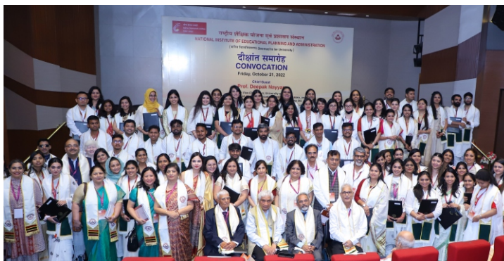
Convocation October 21, 2022

The scholars registered for the PhD Programme will work on an approved topic and submit the thesis under the allocated supervisor. In accordance with the UGC guidelines each scholar will be assigned a Doctoral Advisory Committee (DAC) consisting of internal and external experts. The DAC will provide