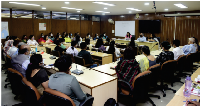
MPhil and PhD Scholars Interaction Programme

This programme is designed to build the research capacity of scholars from varied backgrounds and provide a strong knowledge and skill base in related areas of educational policy, planning, administration and finance. The research studies completed under the PhD programme are expected to make significant contributions in enriching the knowledge base, besides providing critical inputs for policy formulation, implementation of reform programmes and capacity building activities. The broad areas of research covering school and/or higher education are as under: