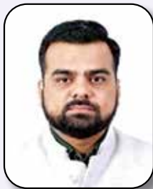
Programme Deputy Director