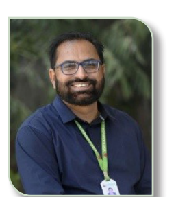
Programme Batch Local Co-ordinator