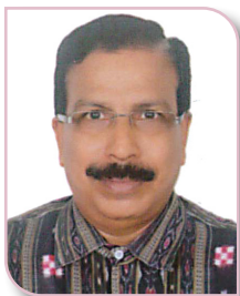
Programme Batch Co-ordinator

University), Forum of Federation, Canada, Bergoff Foundation, Germany; ICSSR- NRCT, Thailand. Awardee of Sauma cum Laud (High Distinction) in the course on Decentralisation and Governance at the Institute of Federalism, University of Fribourg, Switzerland. He served as a member of editorial Boards of six national and international journals; and members of governing and academic bodies of universities and colleges besides being a member of over 50 expert committees of the UGC and ICSSR.