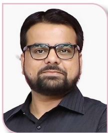
Programme Deputy Director