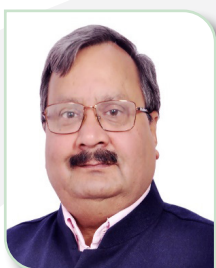
Programme Batch Director